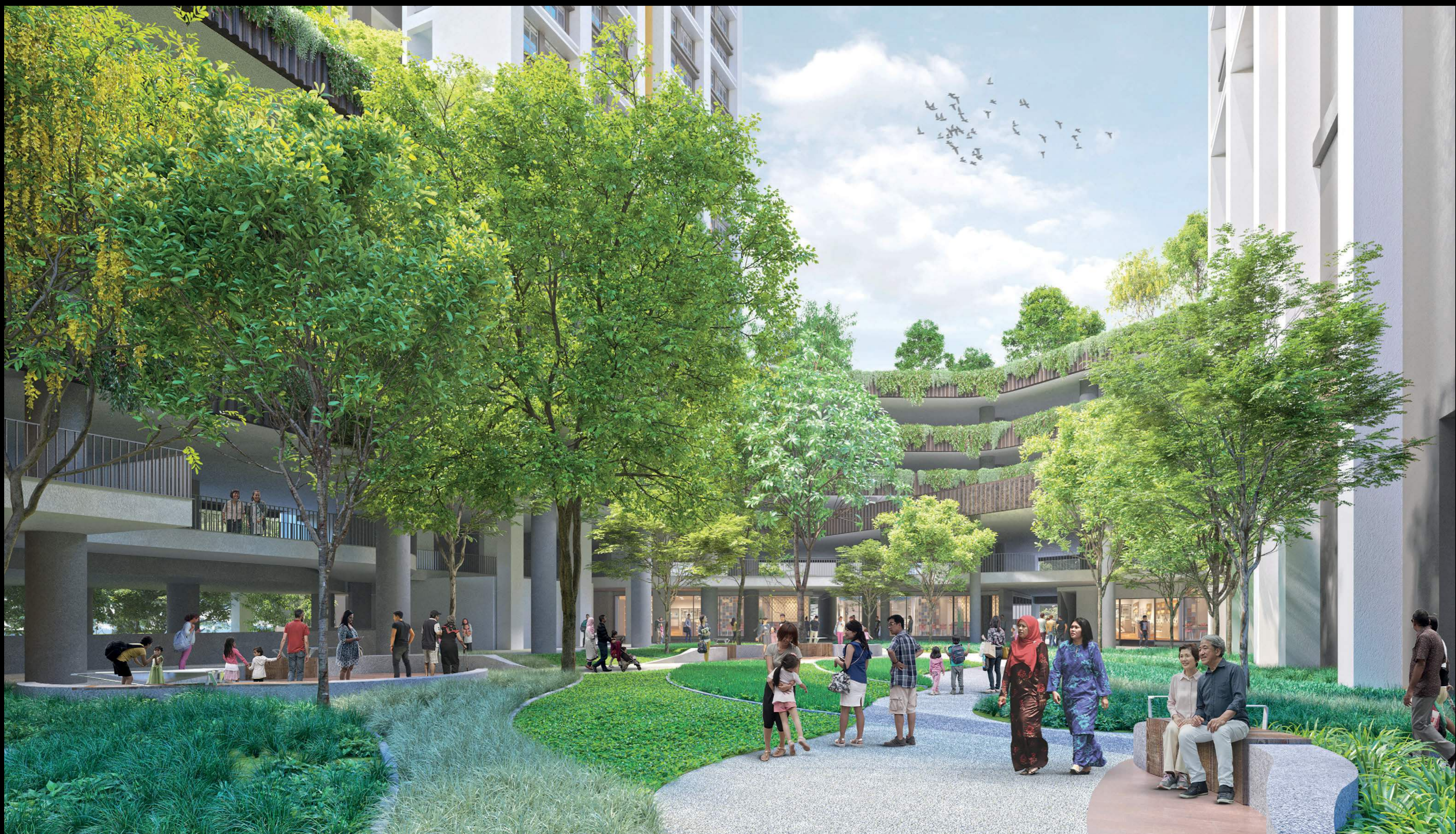
Urban Gardens as Gathering Spaces