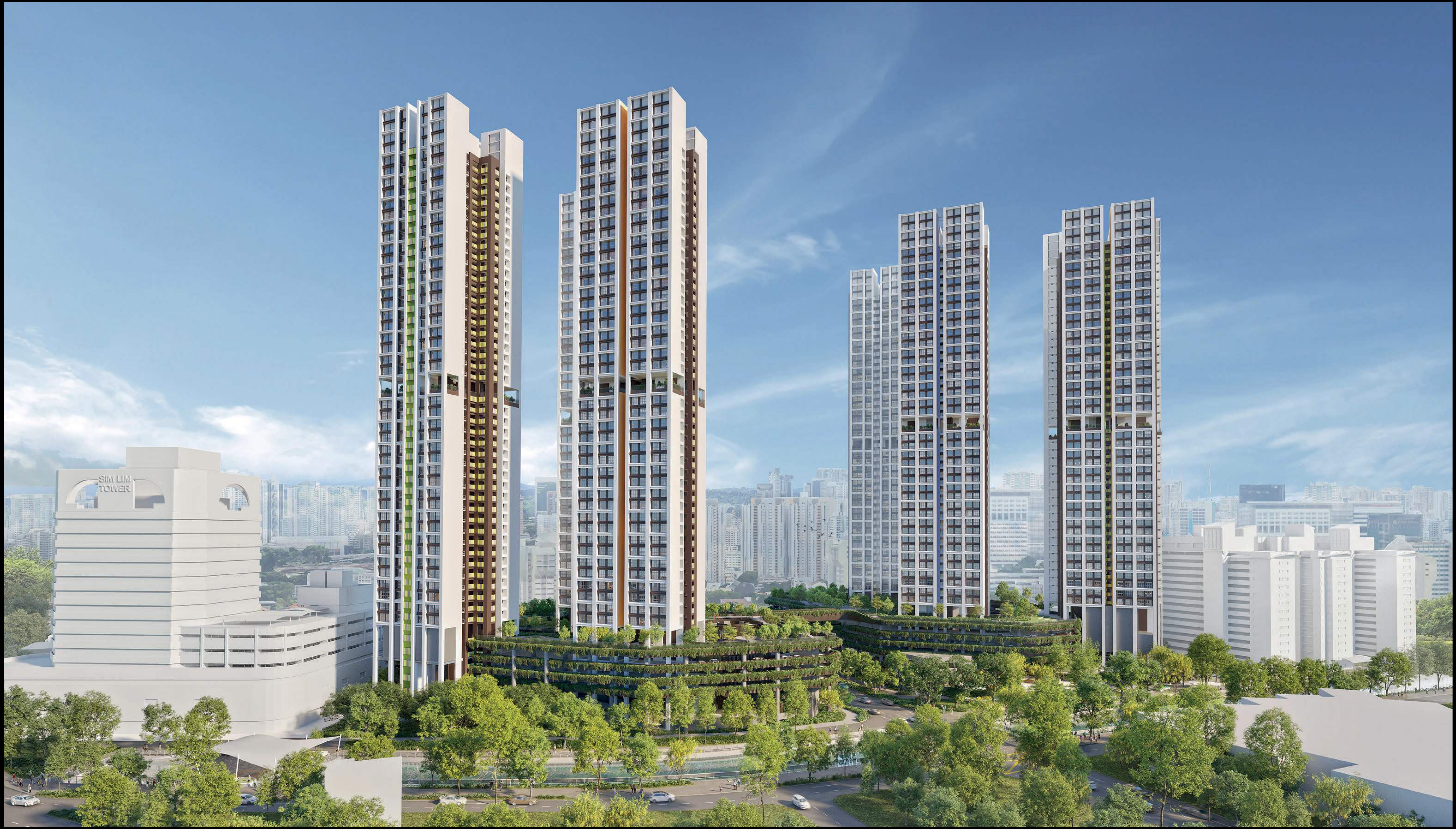
Envisioned as a green oasis, the lushly landscaped courtyard gardens provide residents with a quiet respite from the hustle and bustle